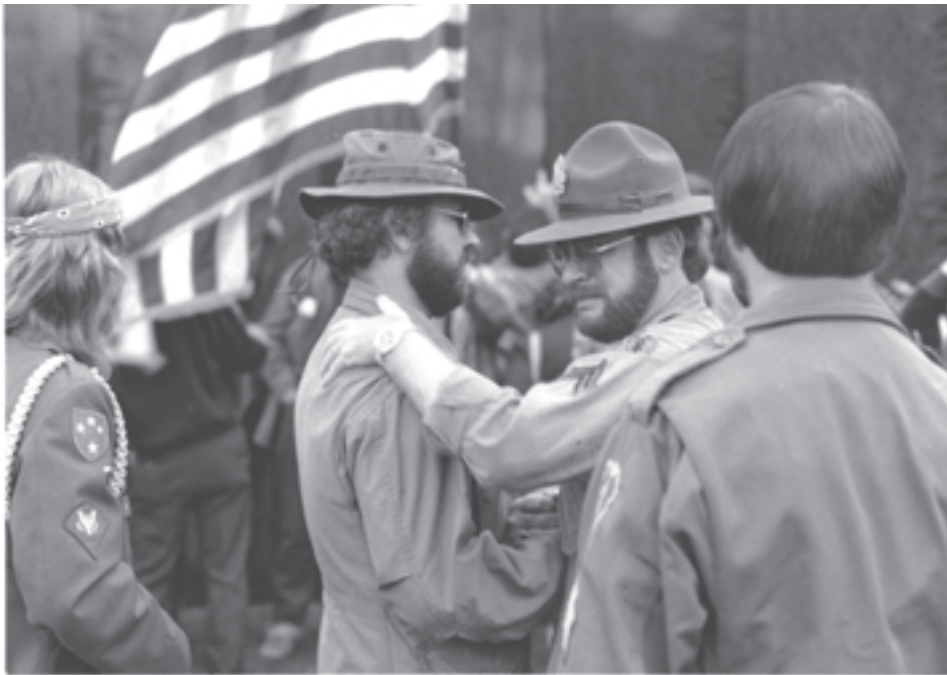
This scene caught my eye immediately, and still demands strong emotional response. It appears that these two were comrades in Vietnam and just became reacquainted at the Wall.

dedication. I found an open area near the monument set aside for Gold Star families.